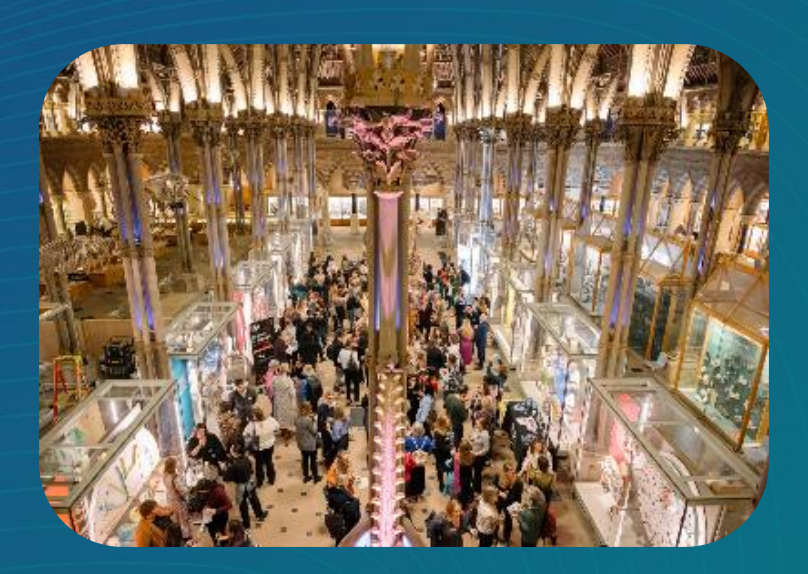
Women in Biotech Cambridge, West London, Edinburgh, Oxford, London