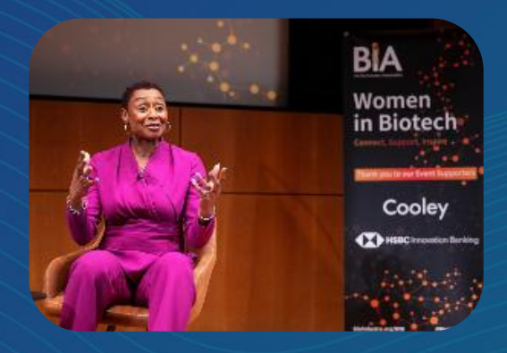
Women in Biotech – Cambridge ("BIG WIB")