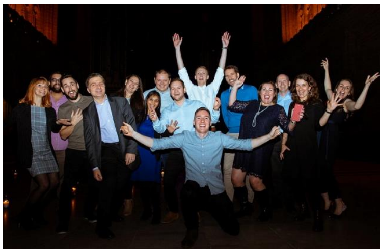
LeaP celebrating at bioProcessUK 2019