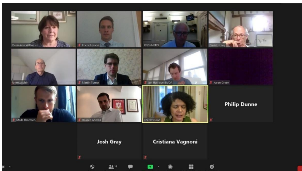
The APPG for Life Sciences hosted a virtual briefing with Daniel Zeichner MP, Chi Onwurah MP, Philip Dunne MP and Lord Lipsey on the industry's response to COVID-19.